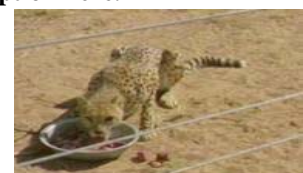
Put a great picture here.

Title Tell about your great picture in a caption here.