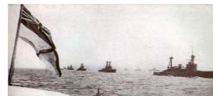
British ships sailing out to sea.

New Zealand and the Union of South Africa.