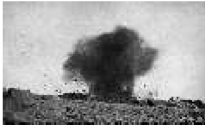
German artillery shell exploding near British lines.