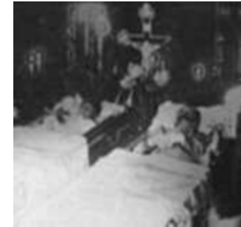
The Archduke and Duchess lie dead in Sarajevo.

The three countries that came together to fight were known as the Triple Alliance. They fought the other countries known as the Triple Entente, which were Britain, France, and Russia. Italy was the other country that came together to fight with Austria-Hungary and Germany. The country of Italy betrayed the other two countries and joined the Triple Entente to fight. The war ended when on November 11, 1918, when Italy, France, and Great Britain smashed Austria-Hungary and caused Austria to sign an armistice.