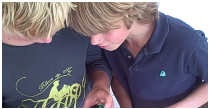
TEST SESSION WITH KIDS: HOW SHOULD THE TATE REACT? BY OBSERVING THEIR USAGE WE COULD DETAIL THE CONCEPT.