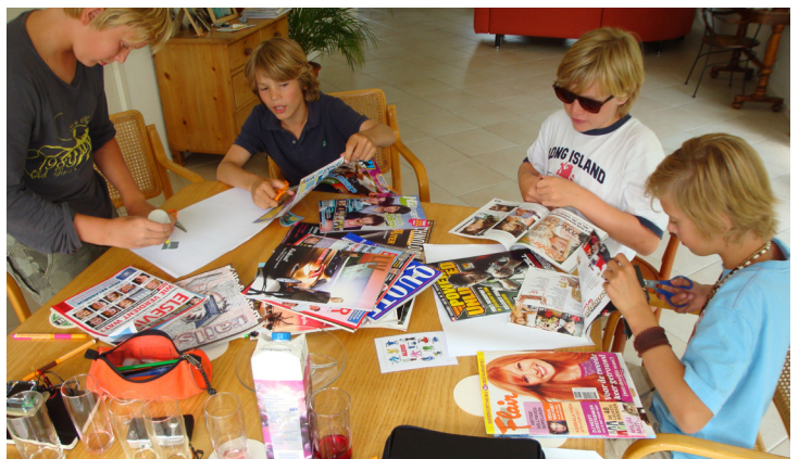
CREATIVE SESSION WITH KIDS: WHAT ARE THEIR EXPECTATIONS?