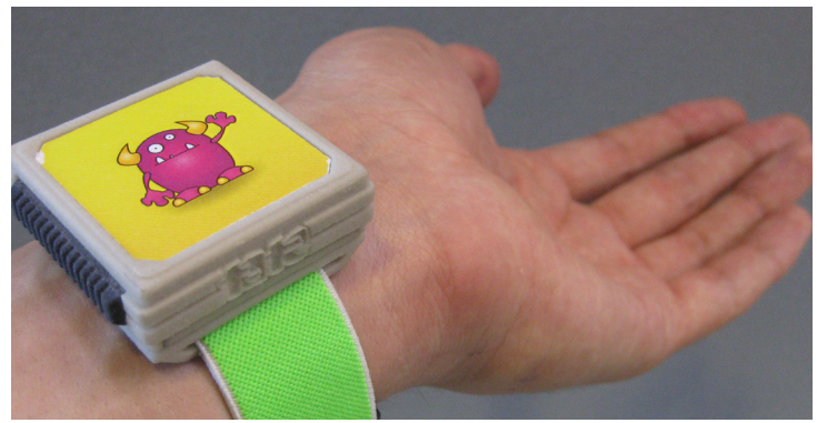
THE P.A.POD ENABLES THE TATE TO FIND, CONNECT AND COMMUNICATE WITH OTHER TATES NEARBY.

EVERY TIME YOU BECOME FRIENDS WITH ANOTHER TATE-USER, YOUR TATE MUTATES WITH THE OTHER TATE. THEREBY DEVELOPING TOGETHER WITH YOU AND YOUR SOCIAL NETWORK.