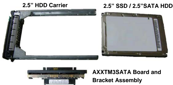
Figure 1: Materials required for assembly

Information in this document is provided in connection with Intel® products. No license, express or implied, by estoppel or otherwise, to any intellectual property rights is granted by this document. Except as provided in Intel's Terms and Conditions of Sale for such products, Intel assumes no liability whatsoever, and Intel disclaims any express or implied warranty, relating to sale and/or use of Intel products including liability or warranties relating to fitness for a particular purpose, merchantability, or infringement of any patent, copyright or other intellectual property right. Intel products are not intended for use in medical, life saving, or life sustaining applications.