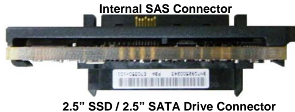
Figure 2: Preassembled AXXTM3SATA Board and Bracket Assembly