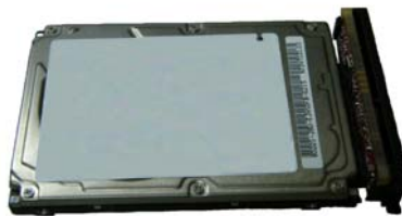
Figure 3: Hard drive connected to the AXXTM3SATA assembly