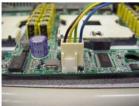
Figure 2: 4-pin fan connector plugged into 3-pin fan header for Processor 1

The Intel® Server® Boards SE7320SP2 and SE7525GP2 support both the active and passive processor SKUs. The active processor heatsink uses 3-pin fan headers on the server board. In addition to continuing to support the 3-pin fan connector, the OEM 10-pack server boards accommodate the new 4-pin connector. For processor 1, this connector is installed onto the 3-pin CPU1 fan header on the server board, with the PWM signal left unconnected. See Figure 2.