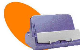
Rapid Charging Cradle