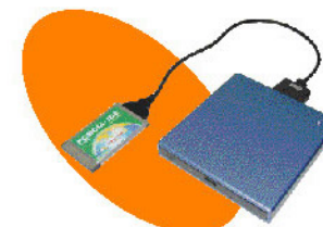
PCMCIA DVD Set