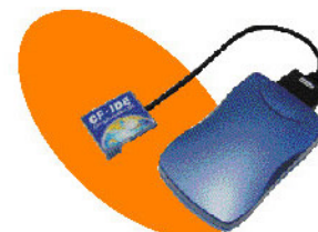
CF / IDE HDD Box

The AquaPAD has its own comprehensive range of accessories. The AquaPAD ships with a docking cradle for convenient, rapid charging and CF/IDE HDD Box to connect to an external hard drive if required. Also available are USB mouse and keyboard and PCMCIA DVD set to give your AquaPAD the power of DVD ROM.